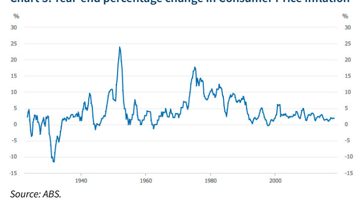
Chart 3. Year-end percentage change in Consumer Price Inflation

As discussed at length in prior quarterly reports, significant competitive forces in on-line retail product distribution will benefit consumers with lower prices, but will also be at the detriment of traditional distribution systems, resulting in a future lower trend inflation. Changes in product distribution are continually facilitating cost reduction and the consumer can be expected to continually benefit. Whilst the weaker AUD could historically result in higher import price inflation, this is now offset by price falls in products across many important categories, that are now both more efficiently produced and distributed. Examples of note include consumer electronics, motor vehicles and clothing.