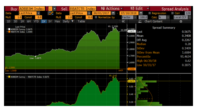
Chart 2. Three month bank bill interest rates and the official cash rate

In combination, the PMT believe the credit margin weakness in the banking sector and the increased forward rate sets, will now deliver a higher yield opportunity to those investing in this sector. We favour investing on any weakness.